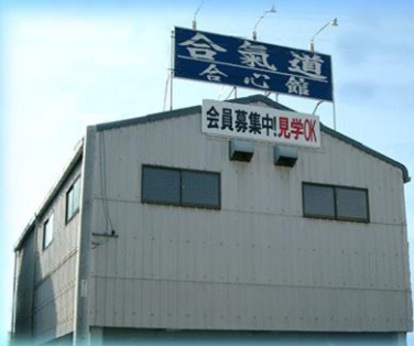
Aishinkan Headquarters 1-22, Misawa 2chome, Matsuyama City, Ehime Pref.